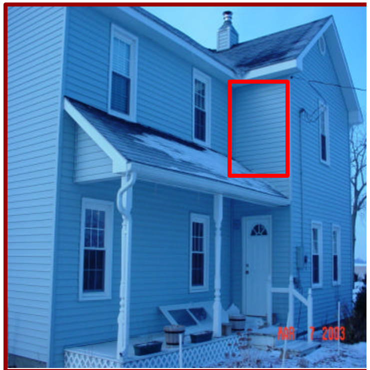
Visual Control Photo

Notes of repairs following the inspection: