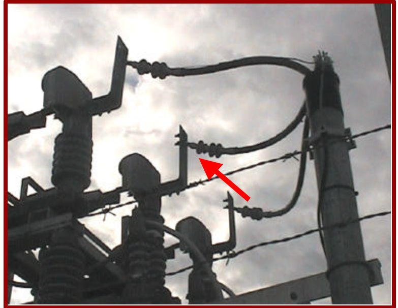
Visual Control Photo