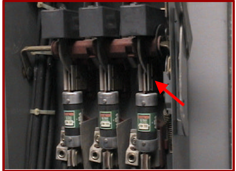
Visual Control Photo